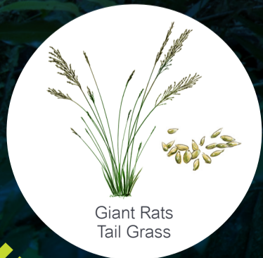
Giant Rats Tail Grass

Get started today and take these plants out of your garden and stop them spreading into the surrounding environment.