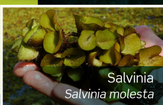
Salvinia Salvinia molesta