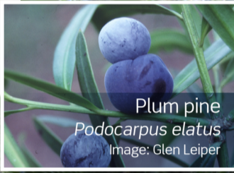
Plum pine Podocarpus elatus