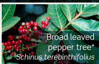
Broad leaved pepper tree* Schinus terebinthifolius