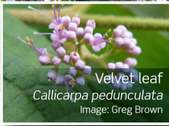
Velvet leaf Callicarpa pedunculata

Gardeners, the diversity you are looking for is at your doorstep - here are just some of our beautiful native plants to put in your garden: