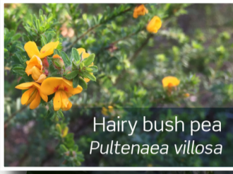
Hairy bush pea Pultenaea villosa