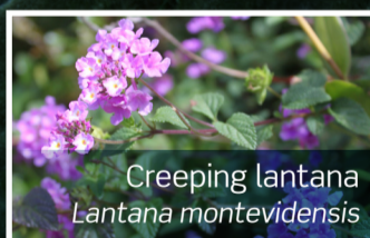
Creeping lantana Lantana montevidensis