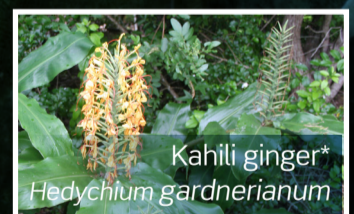
Kahili ginger* Hedychium gardnerianum