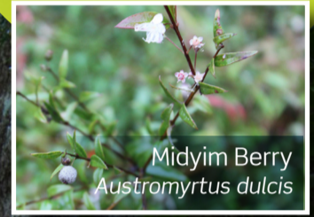
Midyim Berry Austromyrtus dulcis

By planting native plants you are helping to protect our biodiversity and create habitat sanctuaries for our wonderful wildlife.