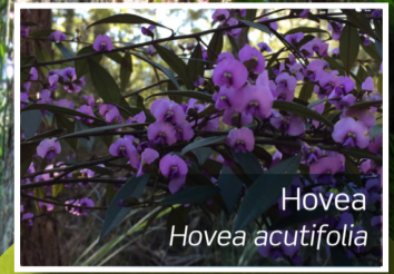
Hovea Hovea acutifolia