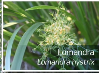
Lomandra Lomandra hystrix