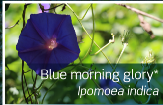
Blue morning glory* Ipomoea indica