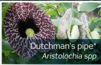
Dutchman's pipe* Aristolochia spp