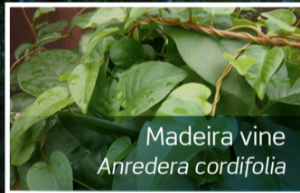
Madeira vine Anredera cordifolia