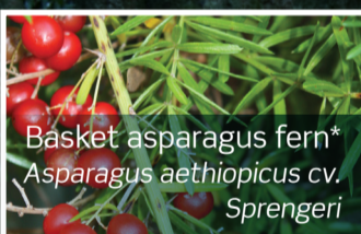
Basket asparagus fern* Asparagus aethiopicus cv. Sprengeri