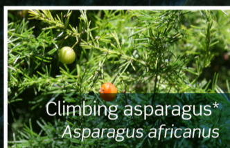
Climbing asparagus* Asparagus africanus