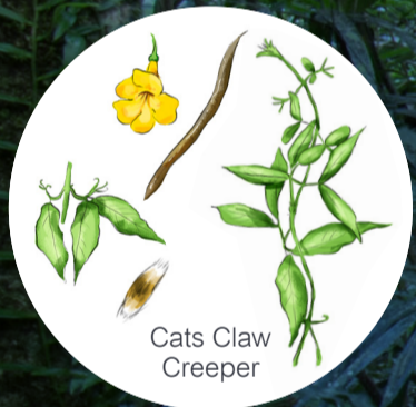
Cats Claw Creeper