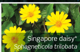
Singapore daisy* Sphagneticola trilobata