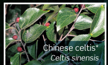
Chinese celtis* Celtis sinensis