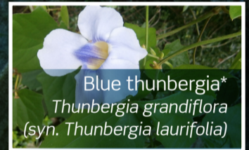
Blue thunbergia* Thunbergia grandiflora (syn. Thunbergia laurifolia )