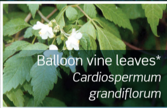
Balloon vine leaves* Cardiospermum grandiflorum