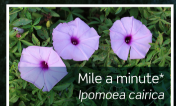
Mile a minute* Ipomoea cairica