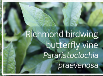
Richmond birdwing butterfly vine Paristoclochya praevenosa