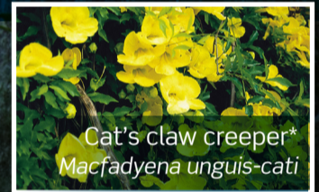
Cat's claw creeper* Macfadyena unguis-cati