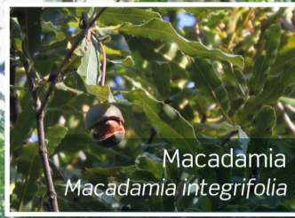
Macadamia Macadamia integrifolia