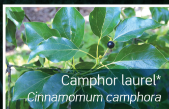
Camphor laurel* Cinnamomum camphora